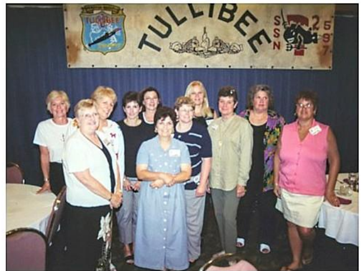
Ladies of the Tullibee Crew