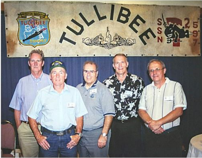
The 60s Crew