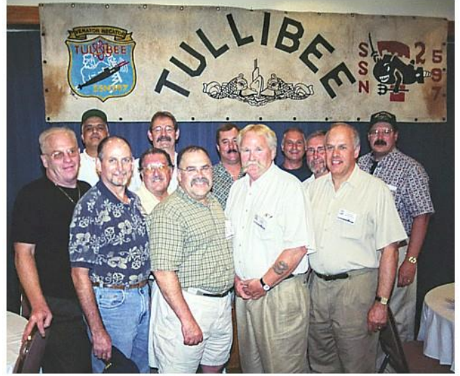
The 70s Crew