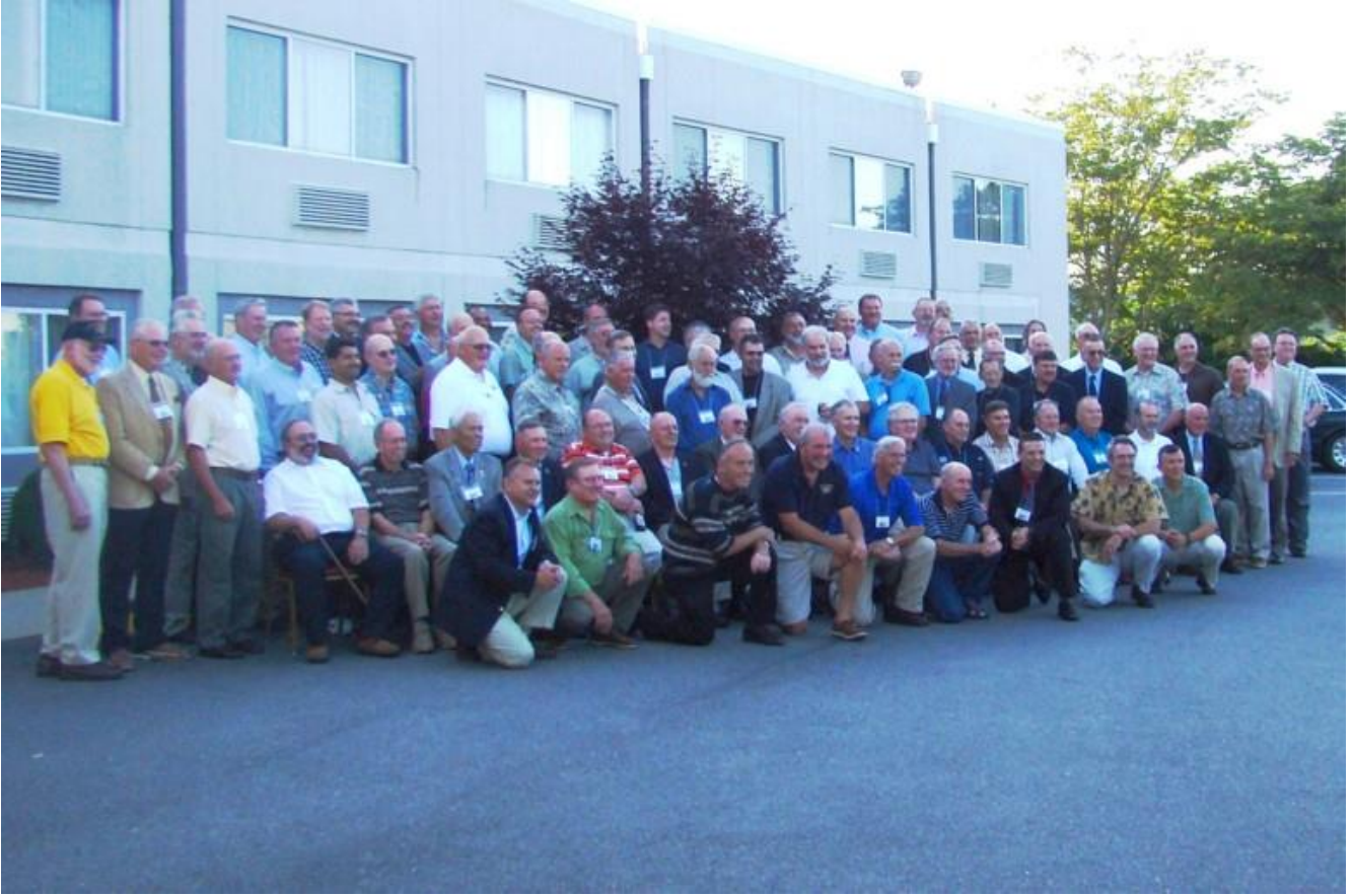
The Tullibee Crew