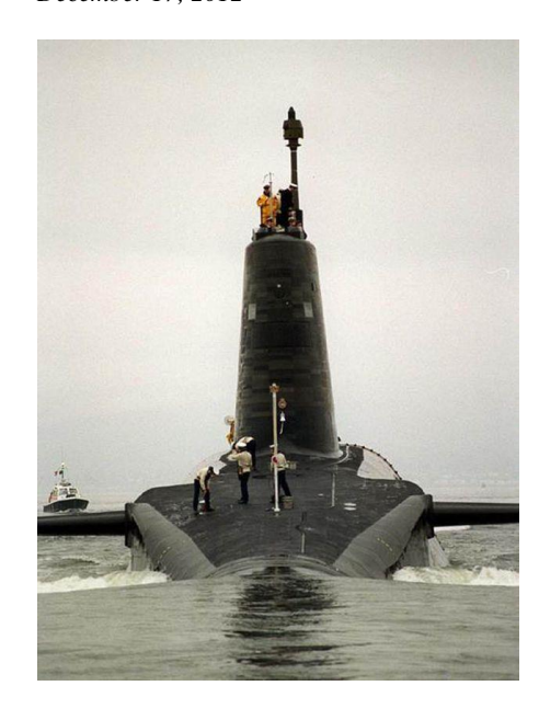
HMS Vigilant - one of the Royal Navy`s Trident submarines

Express.co.uk - By Paul Gilbride, December 17, 2012