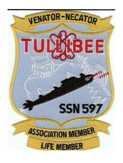
----- Pride Runs Deep -----