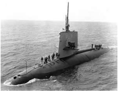
The Scorpion is seen in April 1968. It went down the next month.