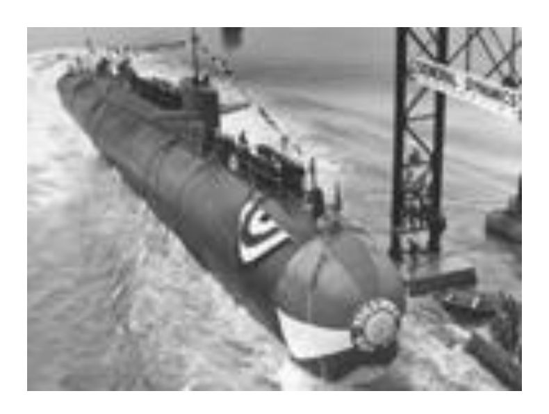
Launching, USS TULLIBEE SSN 597 27 April 1960