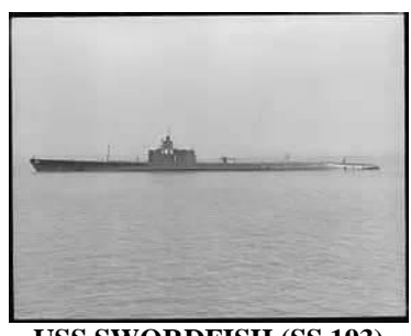
USS SWORDFISH (SS 193) January 12, 1945 – All Hands Lost - 90

USS Argonaut (SS-166) 10-Jan-1943. All hands lost (105). USS Scorpion (SS-278) 5-Jan-1944. All hands lost (78). USS Swordfish (SS-193) 12-Jan-1945. All hands lost (90).