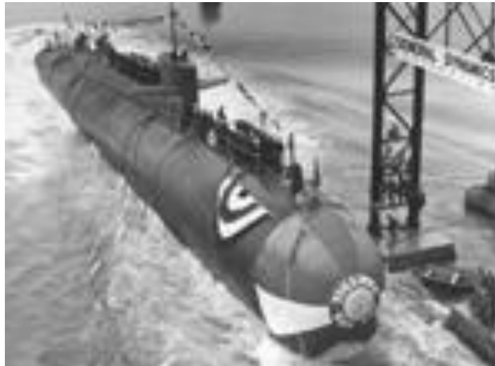
Launching, USS TULLIBEE SSN 597 27 April 1960