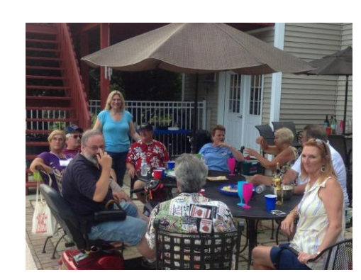
Did you miss the 2013 Reunion? Make plans to join us in 2015! The reunion committee is working to find a place, time, and venues for another great gathering of the crew of the USS Tullibee, SSN 597!