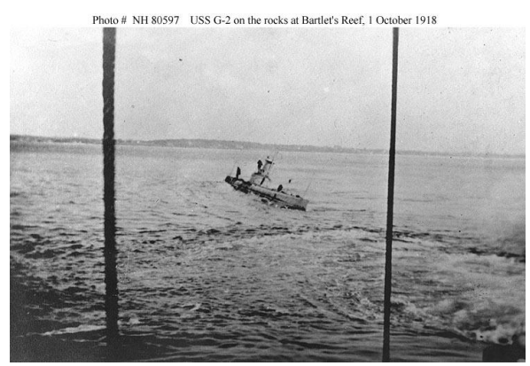
USS G-2 aground on Bartlet's Reef. :