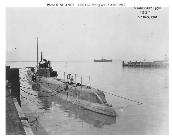
April 2, 1912: G-2 fitting out after first grounding October 1918

An unlucky submarine came to a final end on July 30, 1919 when the G-2 sank off New London, Connecticut. The G-2 was built at Newport News Shipbuilding for the Lake Torpedo Boat Company of Bridgeport, Connecticut; they later sold her to the U.S. Navy. Originally named Tuna she was renamed G-2 on Nov. 17, 1911. On her delivery trip to Bridgeport the boat ran aground off Great Egg Harbor, New Jersey. Fog caused the accident, but the boat was stuck fast. There were nineteen men on board and they at first refused to leave the boat, but with the seas getting heavier fourteen were removed at the request of the captain by the Longport Lifesaving Station.