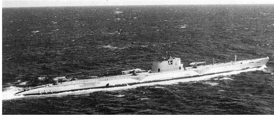
USS Argonaut (SS-166) January 10, 1943 – 105 Men Lost

Originally named V-4, Argonaut was commissioned in 1928. At the time, she was the largest submarine in the U.S. Navy, a distinction she retained until the advent of nuclear submarines in the 1950s. Designed as a minelayer, Argonaut was 385 feet long and displaced 2,710 tons (4,080 submerged), with 4-21" torpedo tubes, and two mine laying tubes aft. As originally configured, 60 mines were carried. She also carried a pair of 6"/53-calibre deck guns, one forward and one aft.