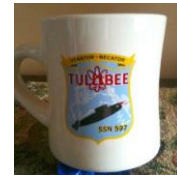
Coffee Mug $13