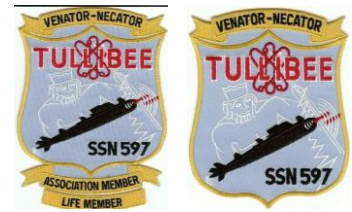
Boat patches: $10 ea or 2/$15

having to reorder soon (as most of you know, the prices of items falls as quantities increase per order), it would be good to receive a preorder from shipmates before I make a general merchandise order with our suppliers. If you are interested in any items, please email me or call me.