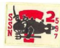
T2 Patch $6