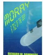
**Moray: A Tale of the Deep