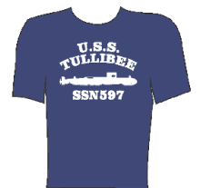
T-shirts $18 (red/blue)