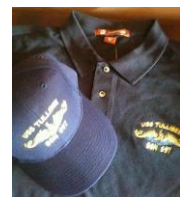
Ball caps $17.25 Polo Shirts: $22.75