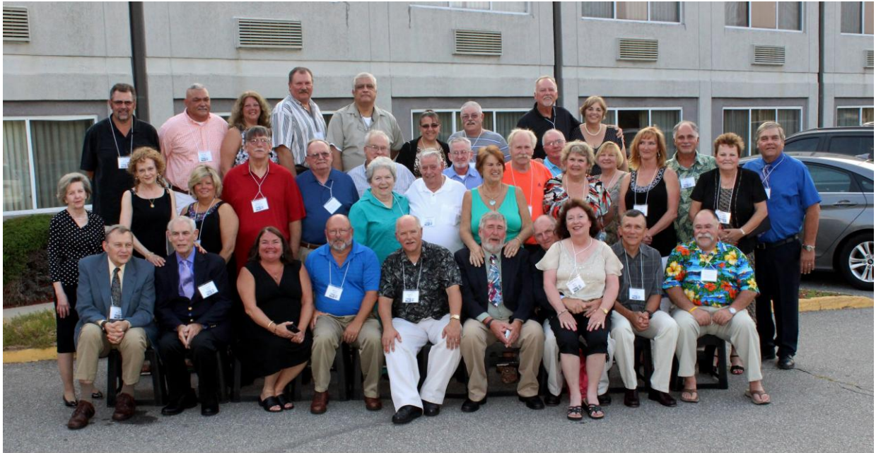
The USS Tullibee SSN-597 Reunion The Crew & Ladies of the 1970's July 2013 ~ Groton, Connecticut