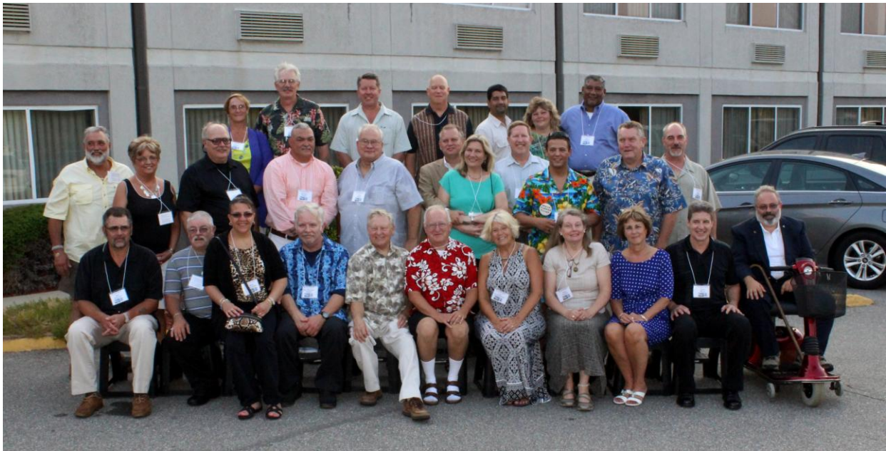
The USS Tullibee SSN-597 Reunion The Crew & Ladies of the 1980's July 2013 ~ Groton, Connecticut