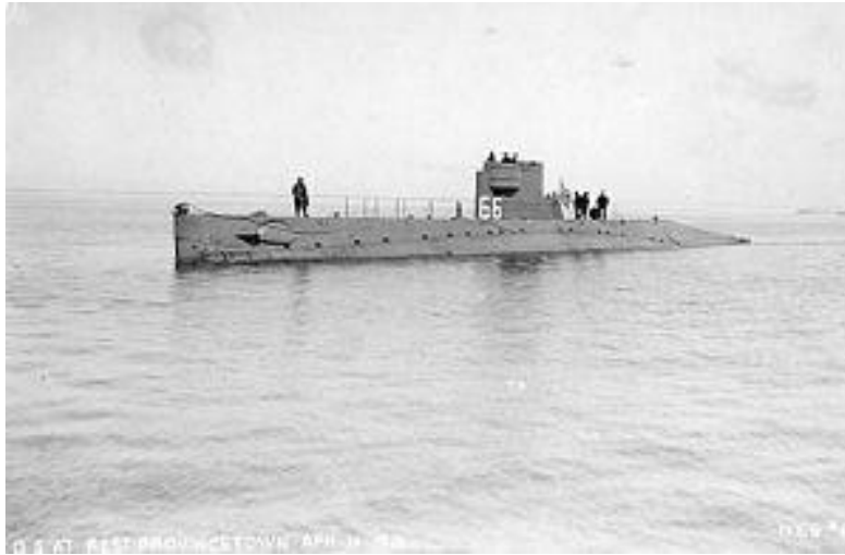
USS O-5 (Submarine # 66, later SS-66), 1918-1923

One of the U.S. Navy's earliest submarines, USS O-5(SS-66) sank on October 28rd, 1923, less than a minute after being involved in a collision with the steamship SS Abangarez.