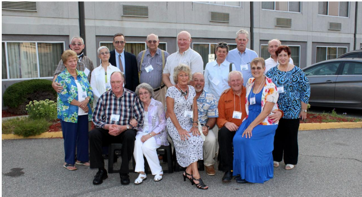
The USS Tullibee SSN-597 Reunion The Crew & Ladies of the 1960's July 2013 ~ Groton, Connecticut