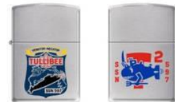
Zippo Lighter $17